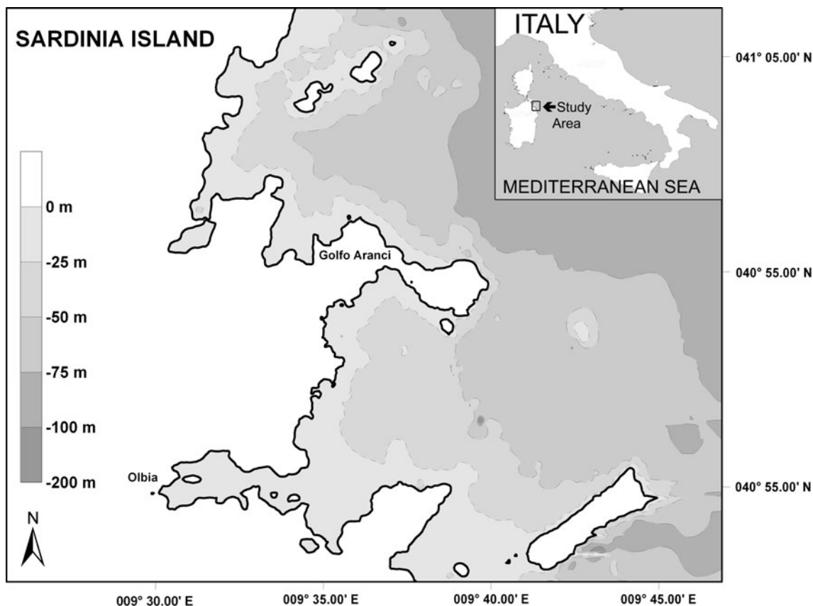
Fig. 1 Map of the north-eastern coast of Sardinia (Italy) showing the location of the marine fin fish farm

40-hp outboard motor. To minimize the effect of the observers' presence on dolphin activity and occurrence, data were collected when the boat engine was off. The fish farm area was surveyed during daylight with at least three experienced observers scanning the sea surface in search for dolphins (with the naked eye and/or with 10 \times 42 and 10 \times 50 binoculars). By the use of night vision binoculars ( 8 \times 40 ) and an omni-directional hydrophone (with a frequency response of 0.02–100 kHz), both observations and passive acoustic monitoring were carried out to obtain information about dolphin presence during the night.